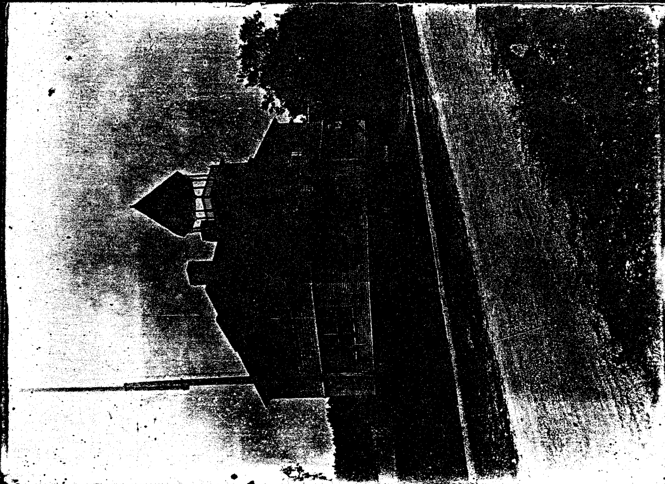
J. H. Stoppani Carriage House, west elevation