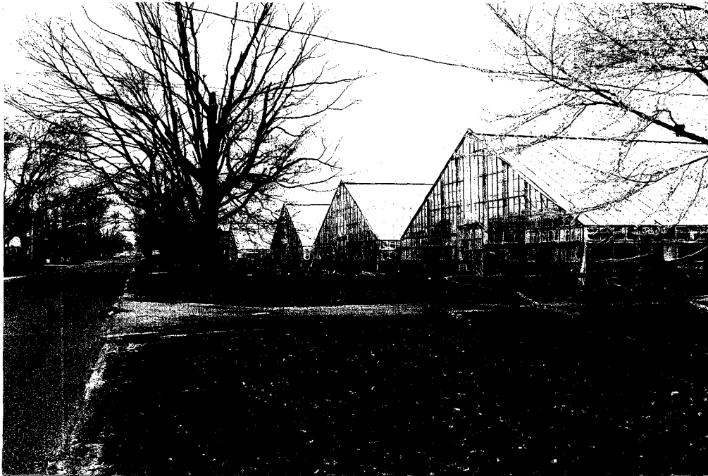
Neg. KK XXII-16, fm. S/SW, showing row of greenhouses. Construction dates are, from south to north, 1929, 1928, 1927, and 1931. The house is located between the first and second greenhouses from the north.