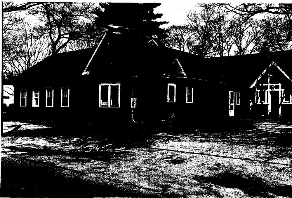
Neg. KK XXI-5, fm. SW, view of parish house .