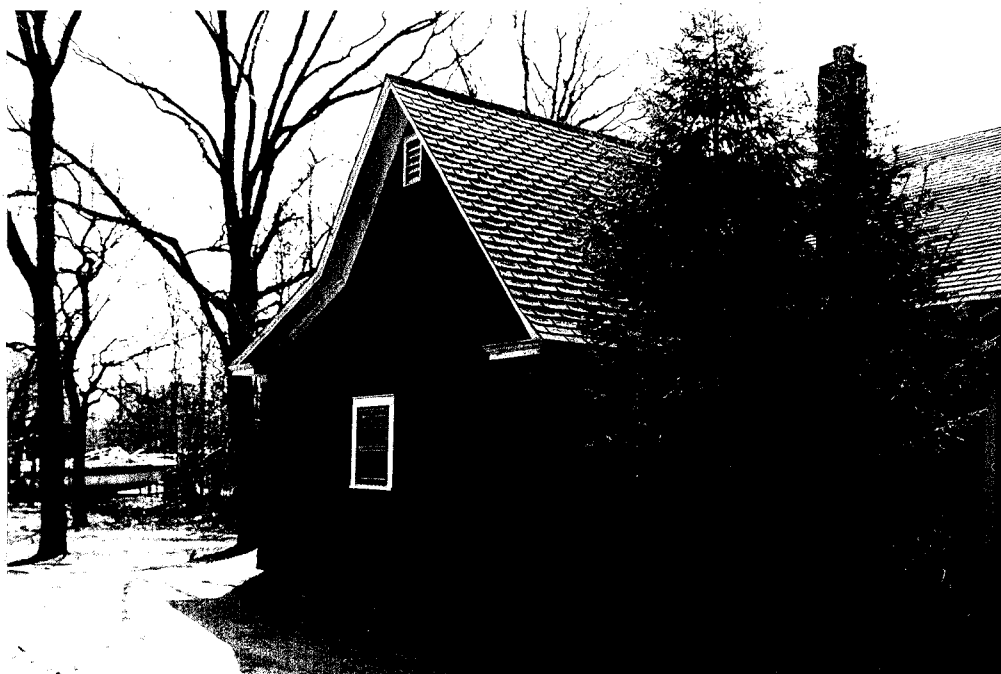
Neg. KK XXI-6, fm. NE, view of gable end of parish house.