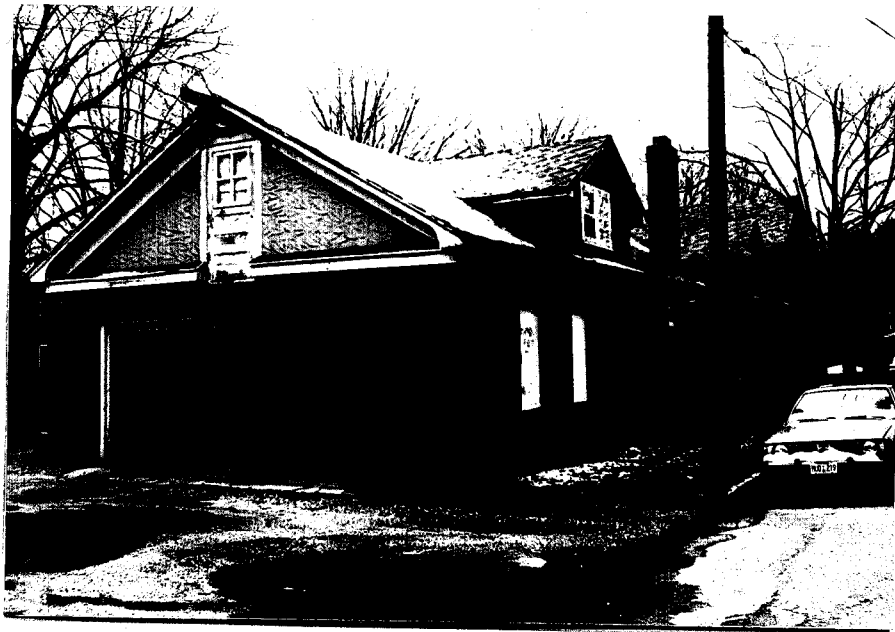
Neg. KK XIX-19, fm. E/NE, view of baking rooms in east wing.