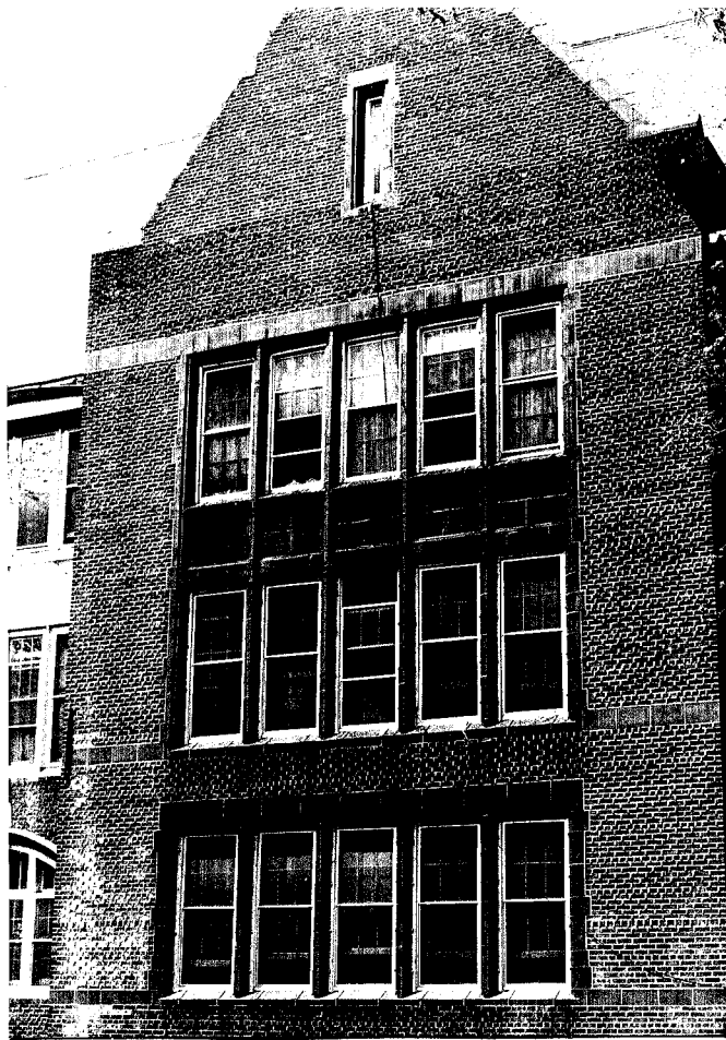
Detail of Building. FRONT Photo:CI-WHC-r-1,16 from SE