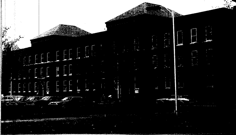
HP-1 Building 10