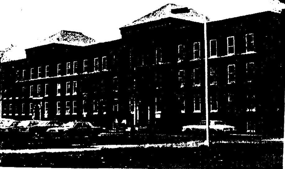
HP-1 Building 10