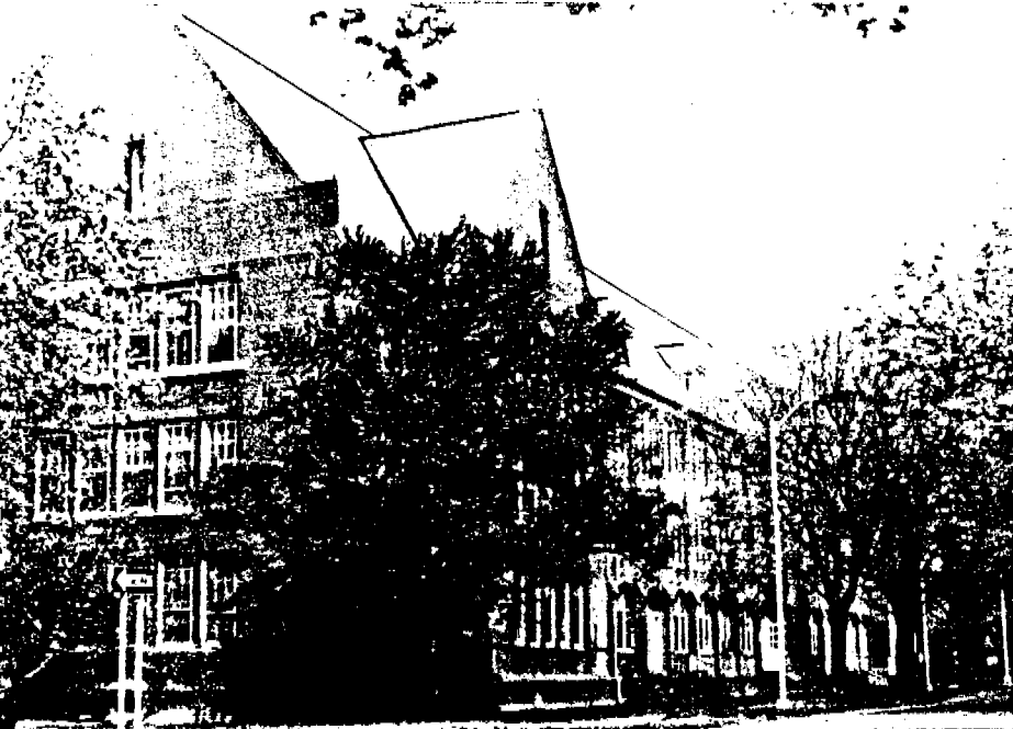
HP-1 FRONT AT RIGHT