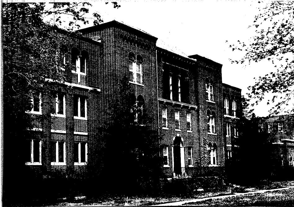
HP-1 THE SOUTH FACADE OF THE WEST WING. ONE-STORY ENTRANCE IS SEEN AT FAR RIGHT.