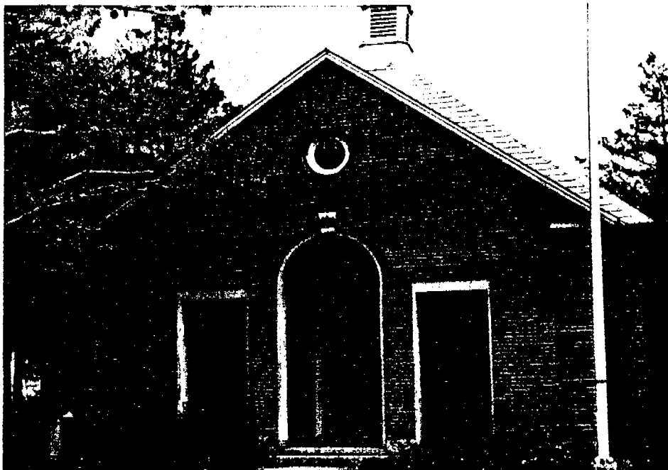
Palladian detail on front