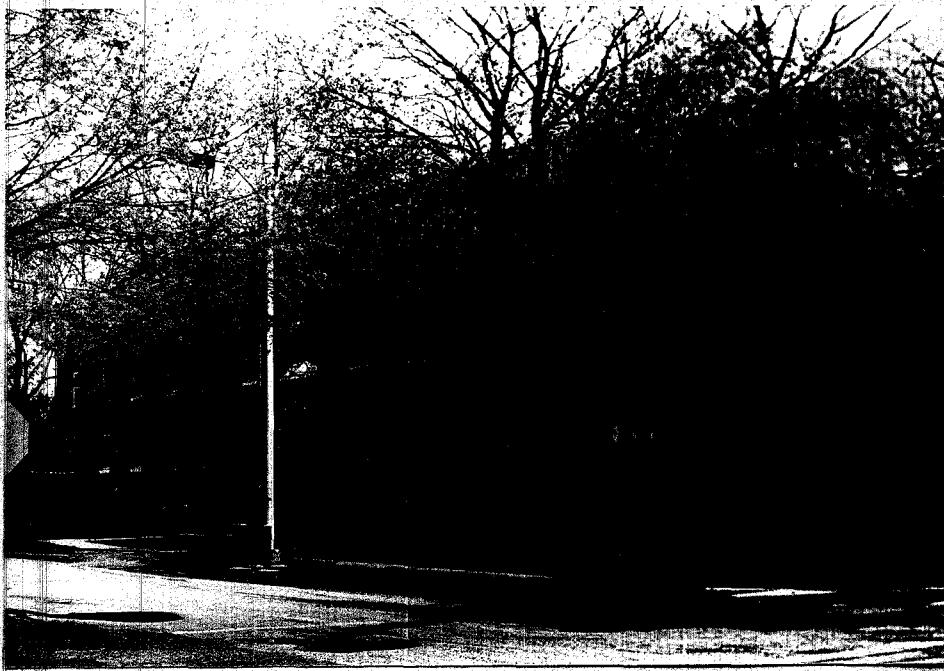
HP-1 Building 13