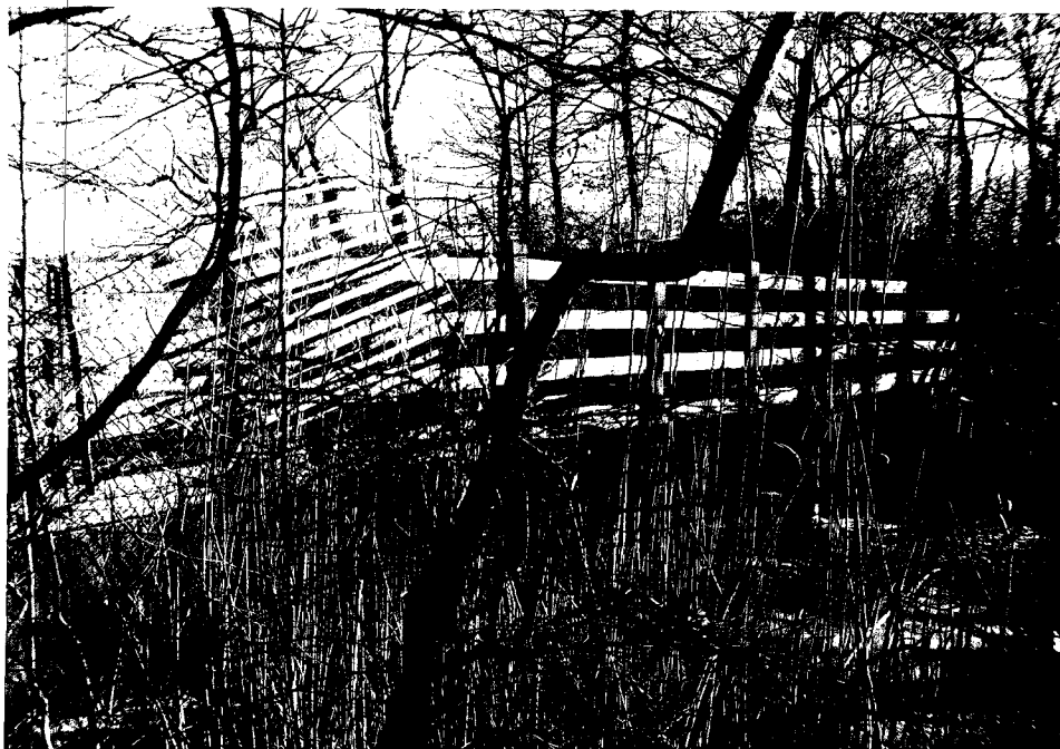
1/1997 View north-east