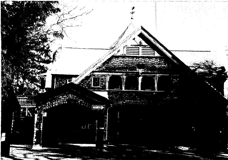
View north 1/1997