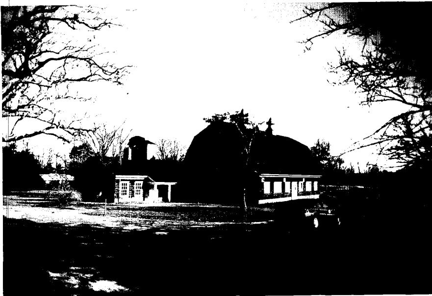
View north-east 1/1997