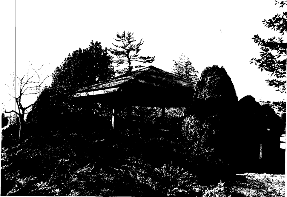
View north 1/1997