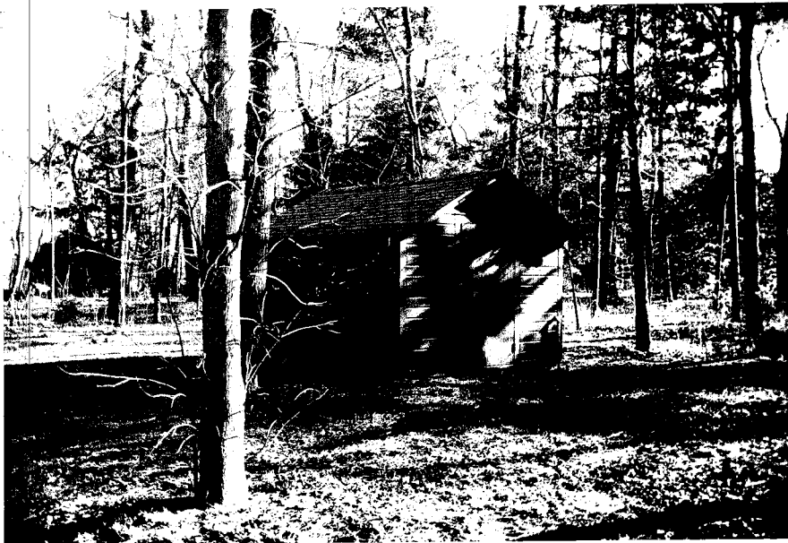
View north 1/1997