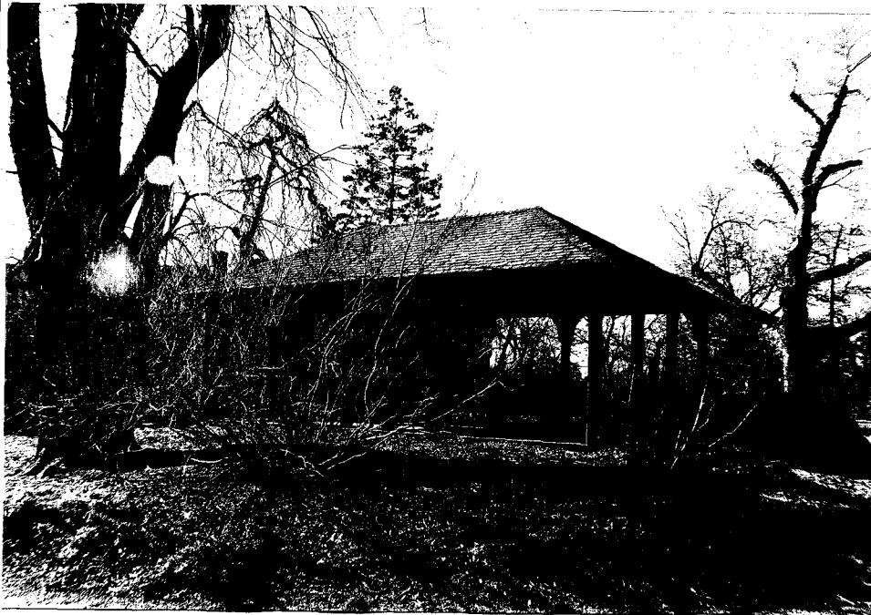
View south 1/1997