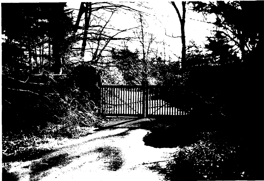
View east 1/1997