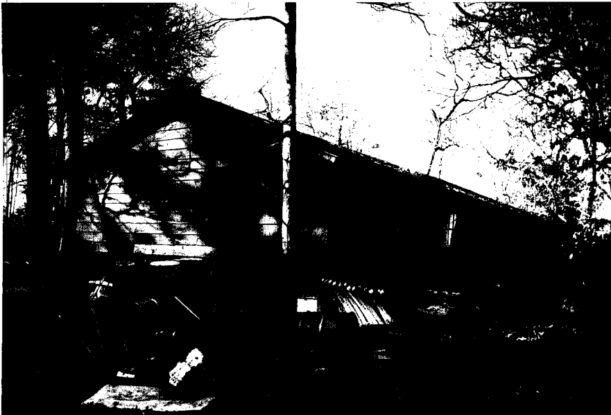
View north-west 1/1997