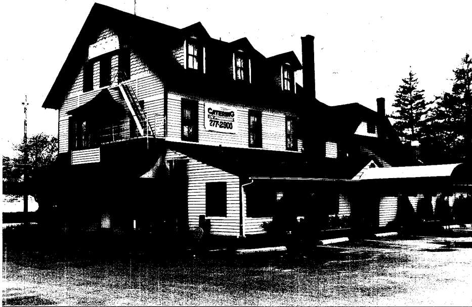
Neg. KK XXIV-25, fm. NE, Moffit Blvd. facade.