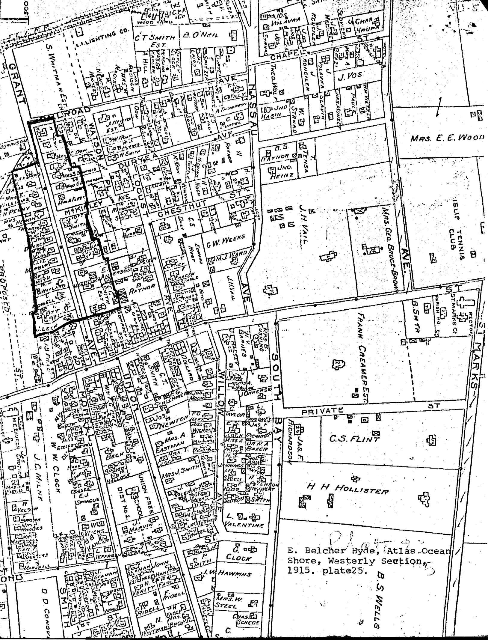
E. Belcher Hyde, (Atlas Ocean Shore, Westerly Section, 1915, plate 25.