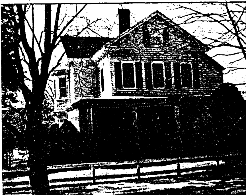
#26 GRANT AVENUE FRONT FACADE