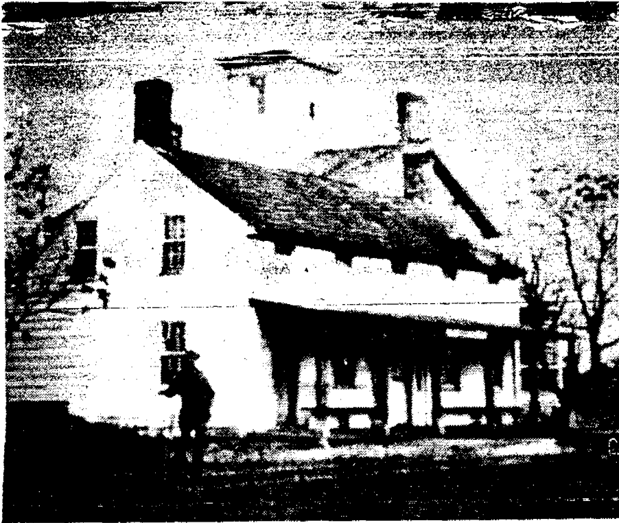
THE old Lakeland Railroad Station on Ocean Avenue. The station was hardly used after a larger station was built in Ronkonkoma.