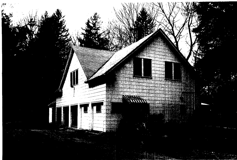
Neg. KK XVII-13, fm. E., view of carriage house NW of house near tree alley leading to Rosevale Avenue.