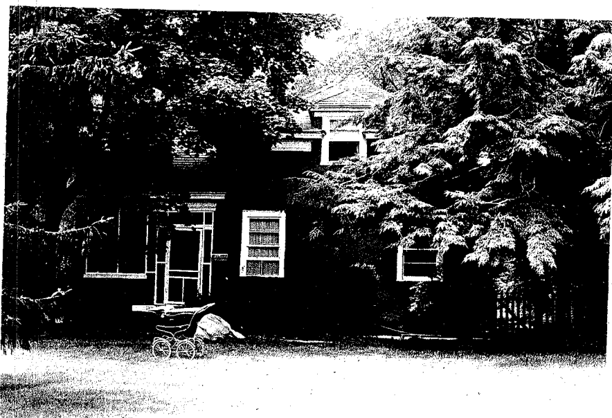
23 Dale Drive, Formerly part of the Frederick G. Bourne Boathouse