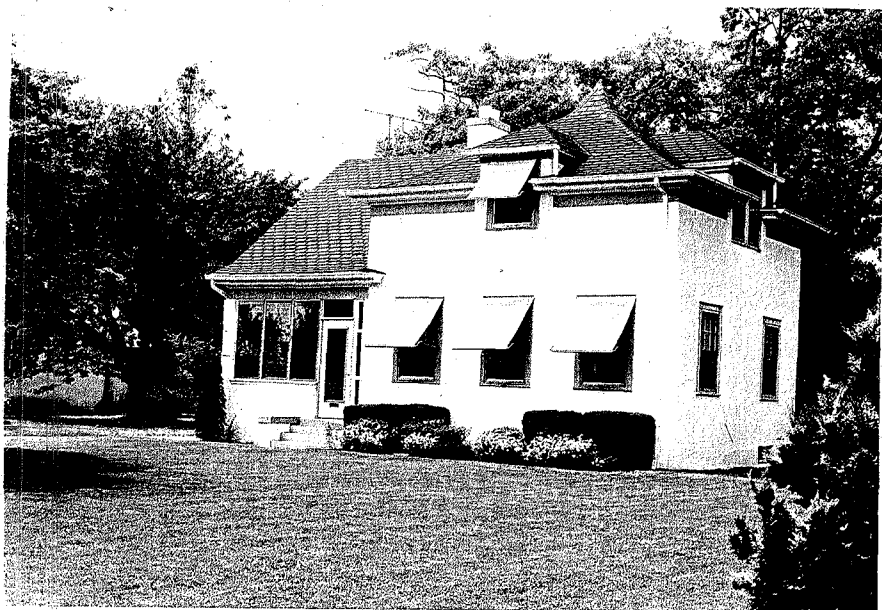
17 Dale Drive, Formerly part of the Frederick G. Bourne Boathouse