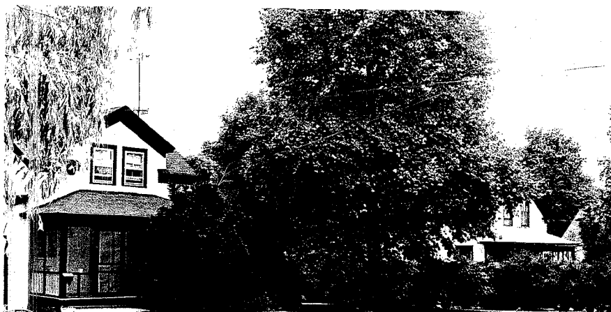
20 Dale Drive, Nelson House and E. Carlson House to the North