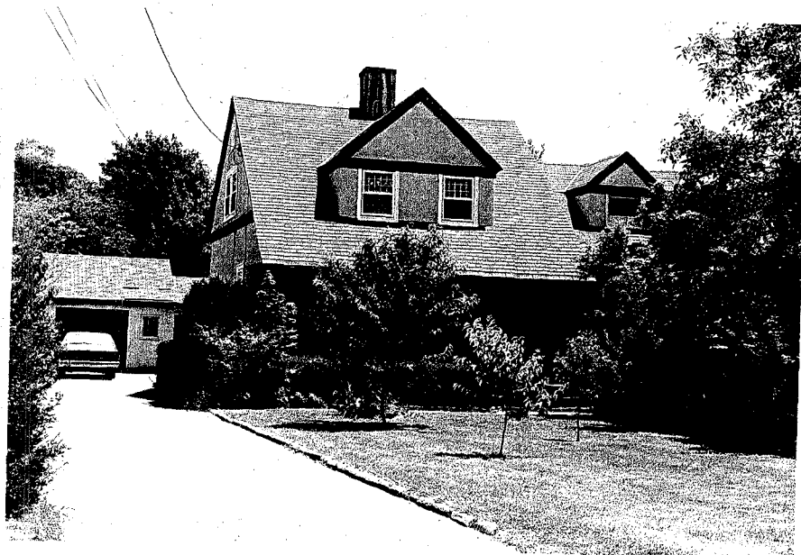
32 Dale Drive, the Messler House, formerly the home of Frederick G. Bourne's chief Mechanic