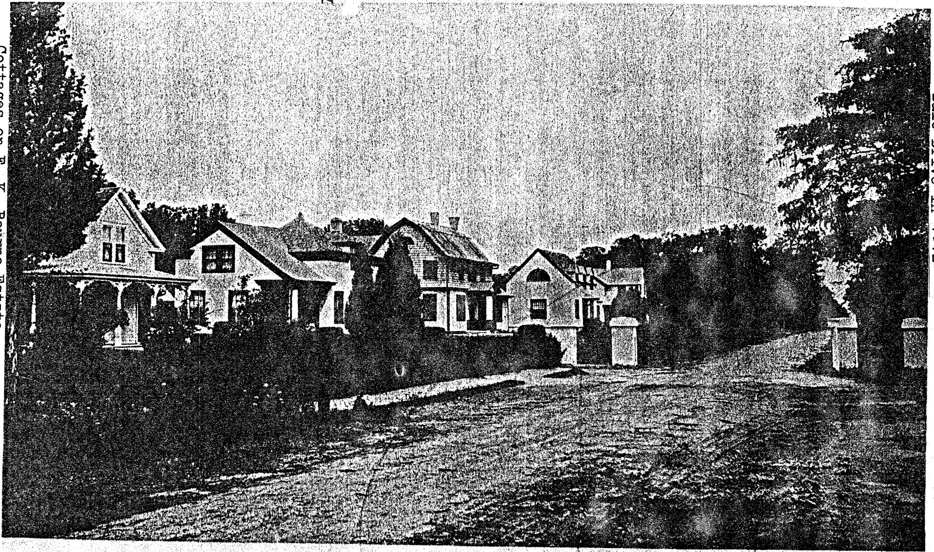
Cottages on F. K. Bourne Estate

Town & Country Nov. 1, 1915 Dale Drive in 1915