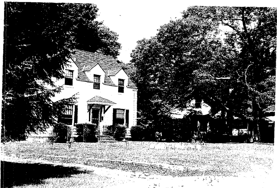
31 Dale Drive, formerly The Frederick G. Bourne Estate Gatelodge