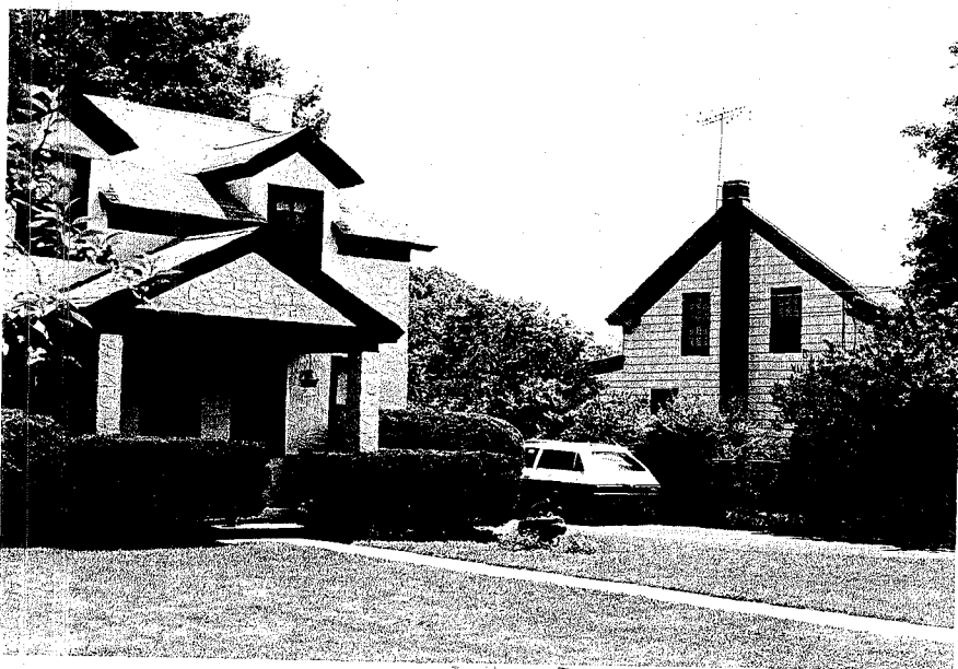
25 Dale Drive, formerly Workmen's Boarding of the Frederick G. Bourne Estate