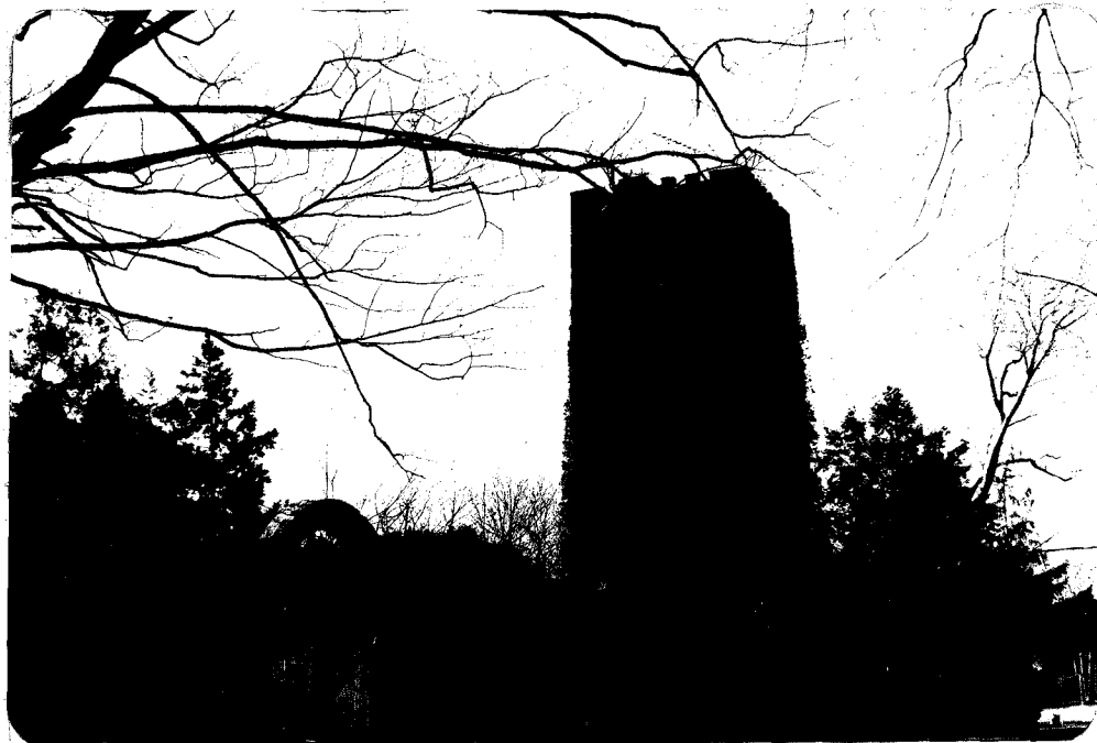
ELW X-2 Remains of West Barn from NE. Clock tower was restored as a residence after the fire.