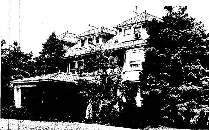
HP-1 front (west) facade