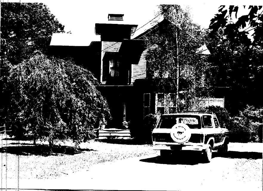
front (west) facade