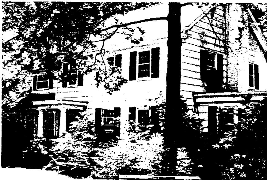
HP-1 view from northwest