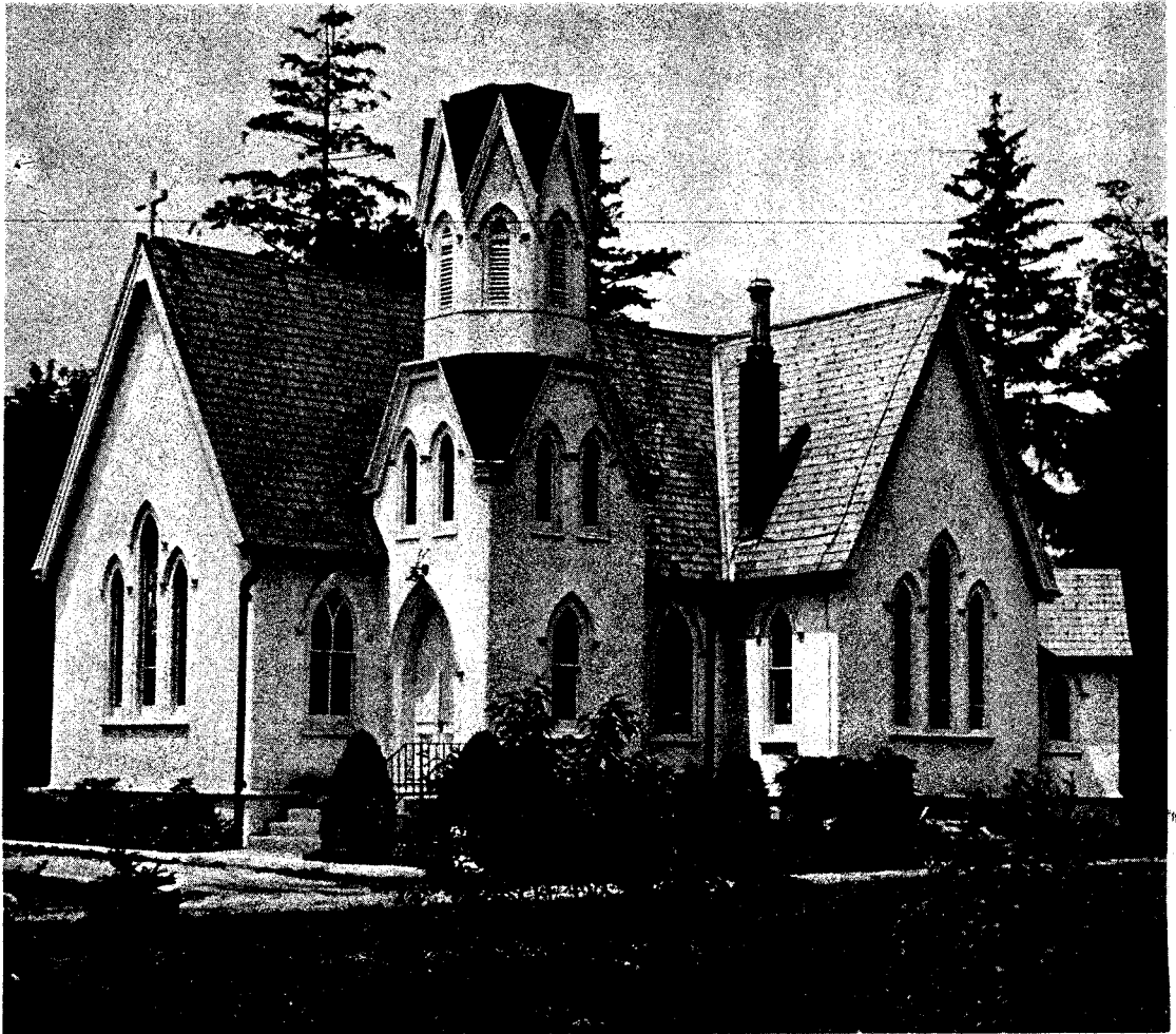
Ukrainian Church, West Islip